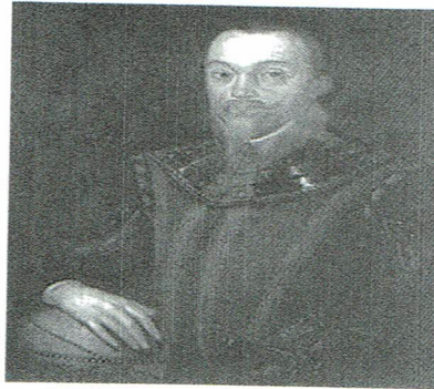
Sir Francis Drake

Drake landed on the coast of California in 1579 to repair his ship . He brought much wealth (stolen from the Spanish) back to England .