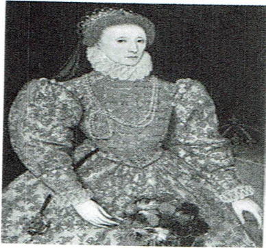
Queen Elizabeth I

Queen Elizabeth I wanted to see England prosper during her reign . She was in a feud with Spain in their quest to dominate the world .